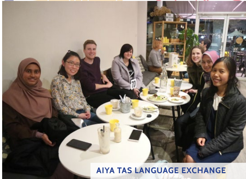
AIYA TAS LANGUAGE EXCHANGE