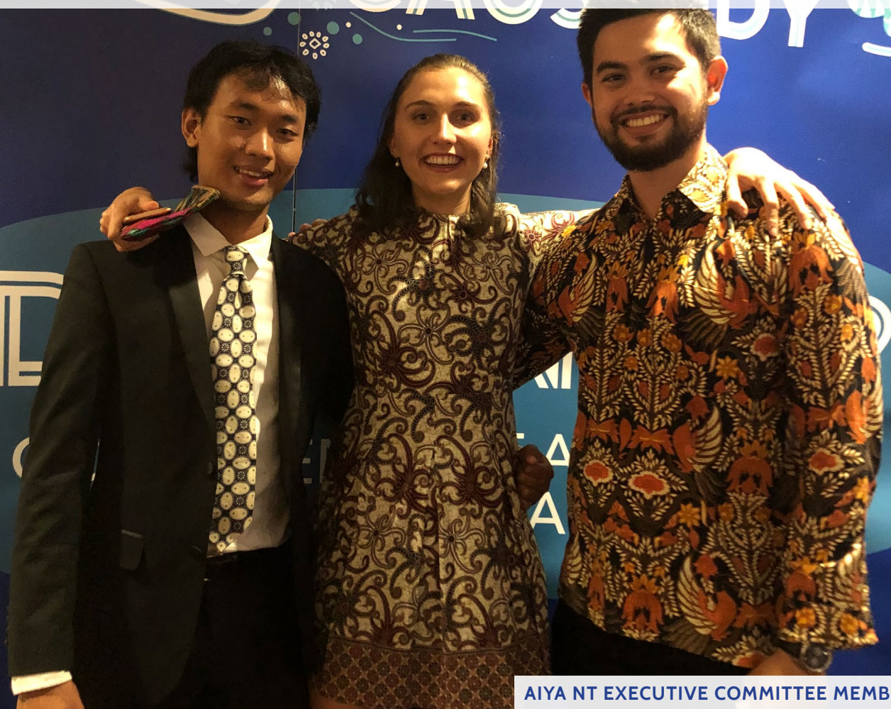
AIYA NT EXECUTIVE COMMITTEE MEMBERS

2019 has been a consistent year for AIYA Northern Territory. We have increased our number of engagements and activities with the wider NT community, and have been more active on social media. Featuring more language exchanges and networking events, this year was all about going back to our roots.