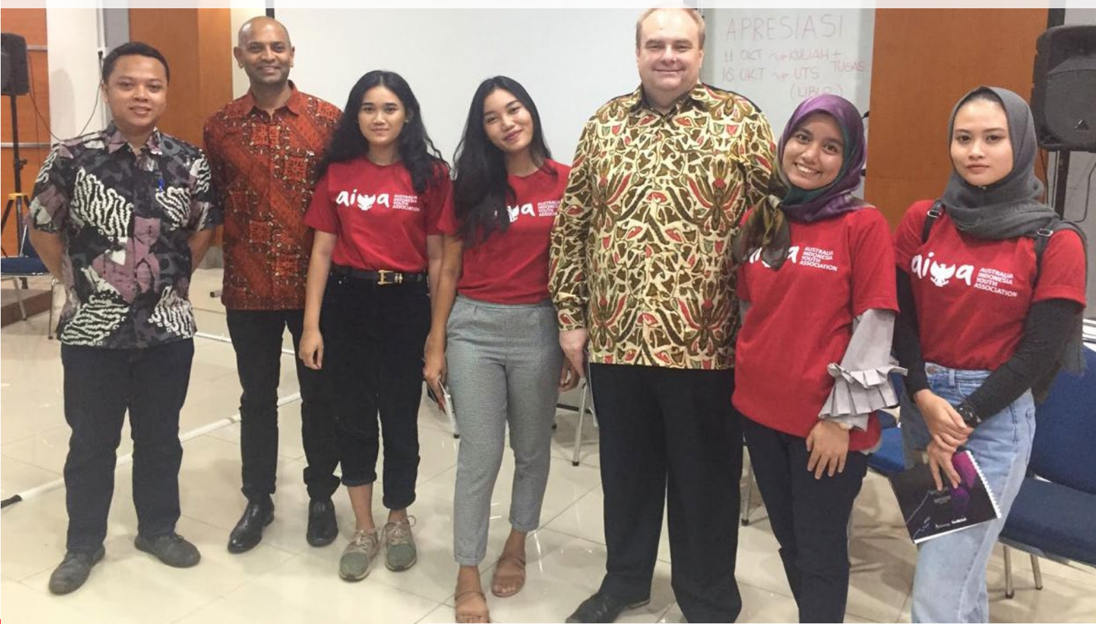
AIYA JAWA BARAT VOLUNTEERING AT ReelOzIND PREMIER SCREENING

AIYA Jawa Barat has had another successful year, read our timeline of events from 2019!