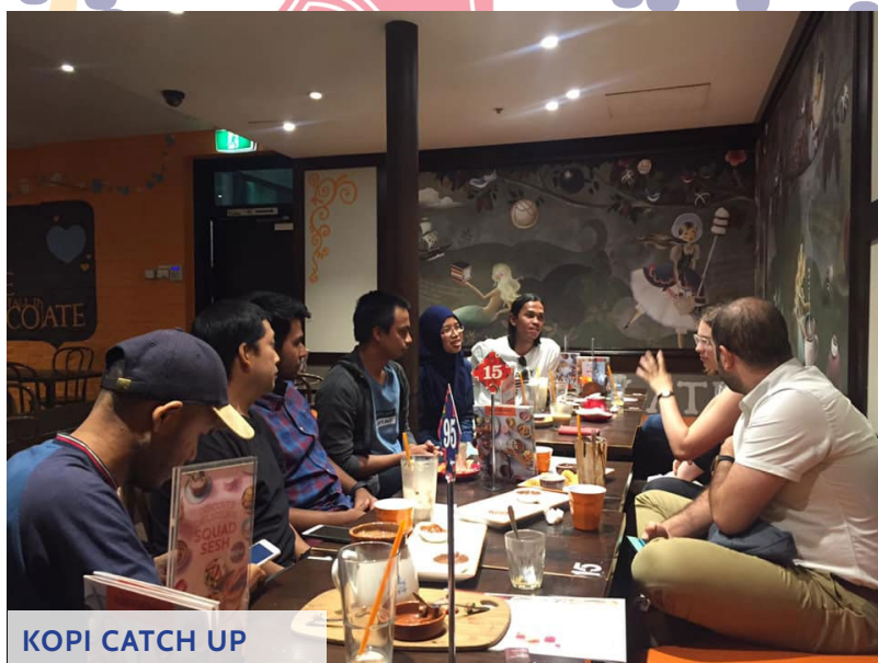
KOPI CATCH UP