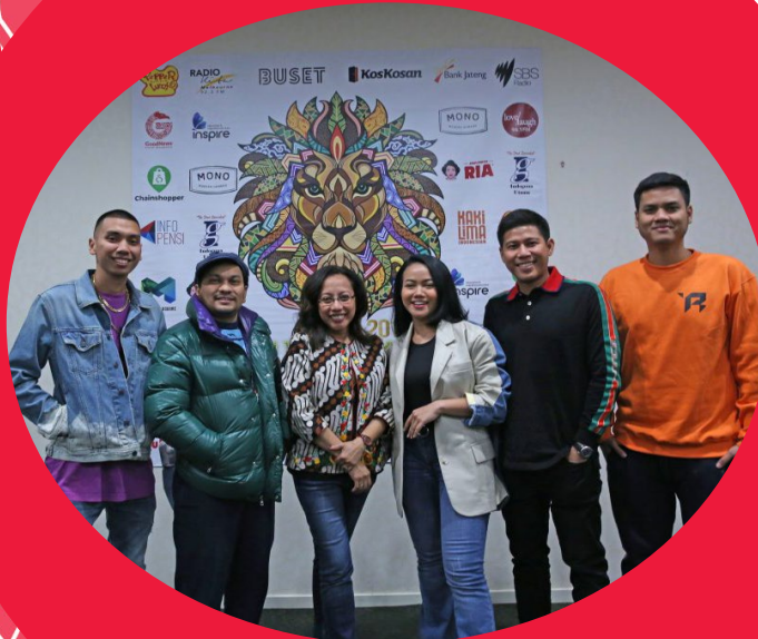
SOUNDSEKERTA PRESS CONFERENCE

With Australia and Indonesia both hosting elections in 2019, it has certainly been a hectic time for both countries. We captured the highlights of Jokowi's electoral victory and predictions for Indonesia's future under the party's leadership following the highly anticipated Constitutional Court (MK) ruling .