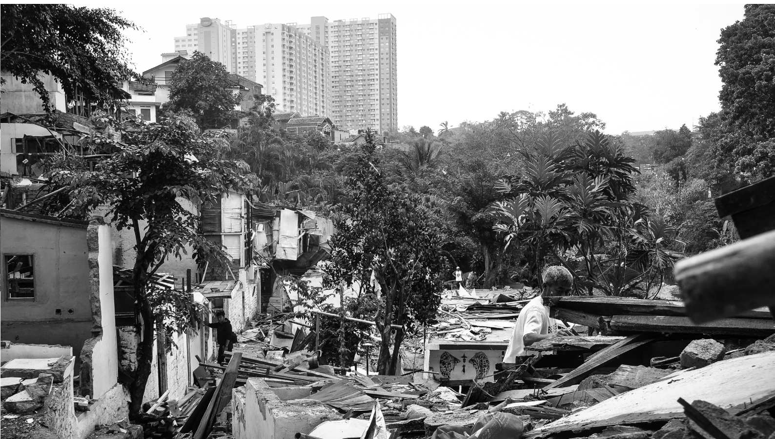
THE KAMPUNG, SOME GREENERY, AND HIGH RISE BUILDINGS: THE LAST VIEW OF KAMPUNG BABAKAN SILIWANGI

In 2013, Bandung elected a new mayor in Ridwan Kamil, who wanted to create a better and more prosperous Bandung for its inhabitants. One part of his plan was to increase the happiness index of the city by creating numerous parks and open spaces so people could interact more in public. Unfortunately, Kampung Babakan Siliwangi fell into a “Green Open Area” in these development plans, meaning it was slated to become parkland.