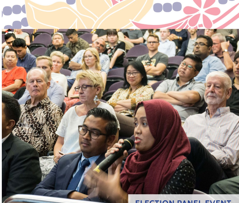
ELECTION PANEL EVENT

Our hope for the year to come is to be increasingly active and enterprising in strengthening Australia-Indonesia relations.