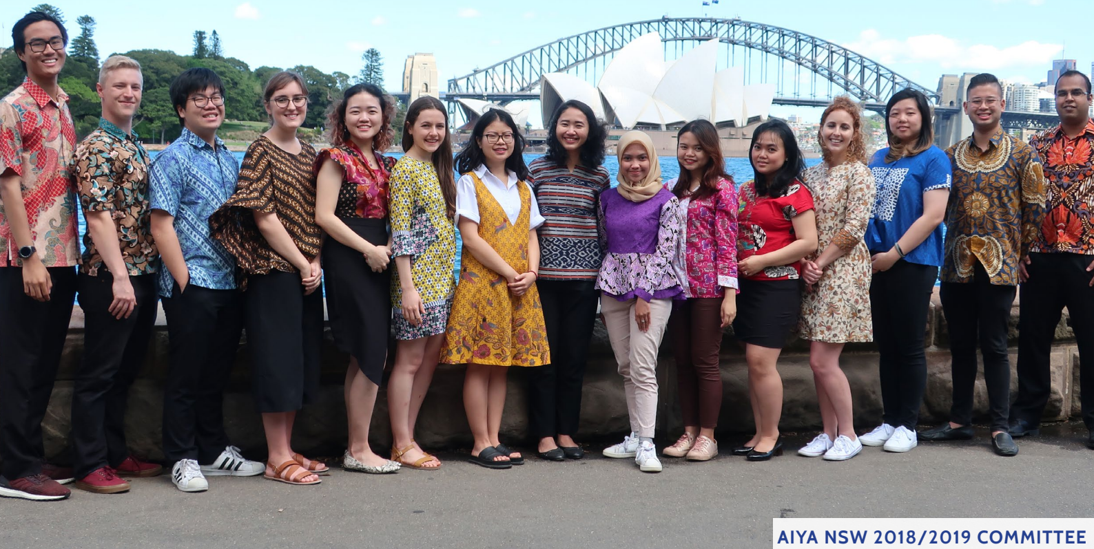
AIYA NSW 2018/2019 COMMITTEE