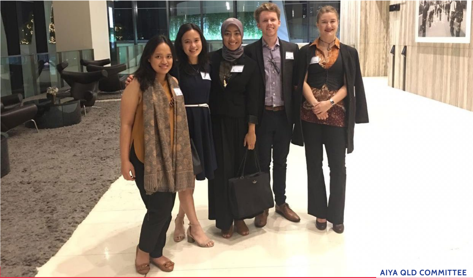
AIYA QLD COMMITTEE

2019 was another exciting year for AIYA Queensland as we strengthened a number of partnerships with other like-minded organisations in Queensland. Despite a quieter start to the year, we managed to host, collaborate and participate in a number of fantastic events.