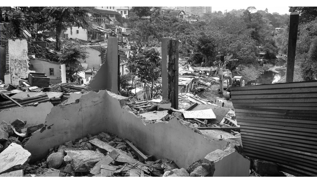
THE DEMOLITION PROCESS HAS BEGUN