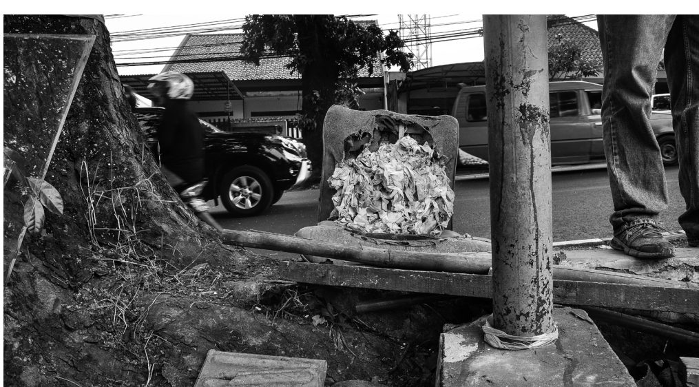
ABANDONED BROKEN SOFA ON THE SIDE OF THE STREET IN BABAKAN SILIWANGI.

The conflict in Kampung Babakan Siliwangi is just a small example of a major issue in Indonesia related to urban development. There are a large number of cases of land conflicts in Indonesia, either between people and government or people and corporations, but one thing is certain - the people always lose.