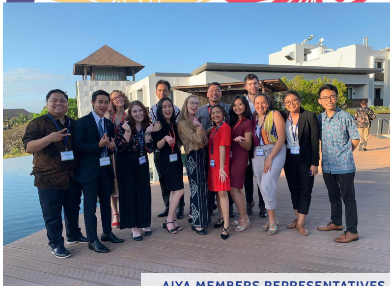
AIYA MEMBERS REPRESENTATIVES