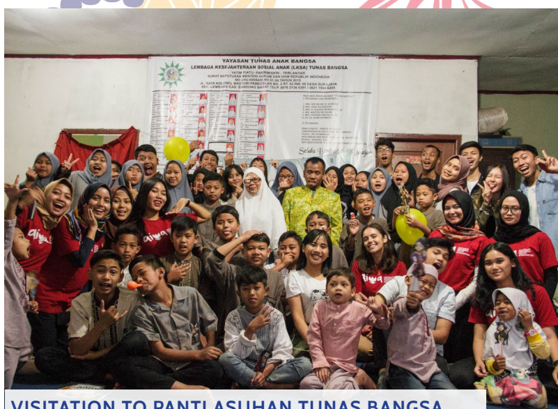
VISITATION TO PANTI ASUHAN TUNAS BANGSA