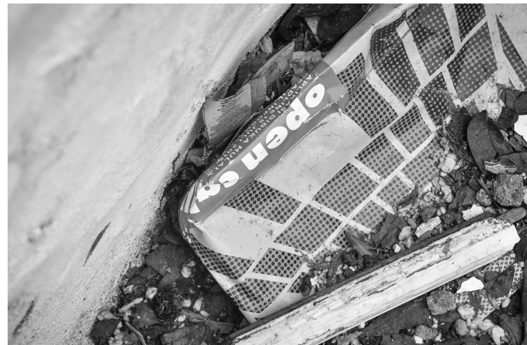
DEBRIS IN ONE CORNER OF THE KAMPUNG

Based on the 2015 census, Bandung is the fourth most populous city in Indonesia after Jakarta, Surabaya and Bekasi, with about 2.5 million inhabitants. Though its history which can be traced back to 1488, the earliest modern development began under Dutch East Indies Company occupation when, in the 17th-18th century, a road was constructed connecting Batavia (Jakarta), Bogor, Cianjur, Bandung, Sumedang and Cirebon. From then on, Bandung evolved into an exclusive European resort area, visited by wealthy plantation owners every weekend and attracting business people from the capital Batavia, which saw cafes, restaurants and high fashion boutiques begin to pop up.