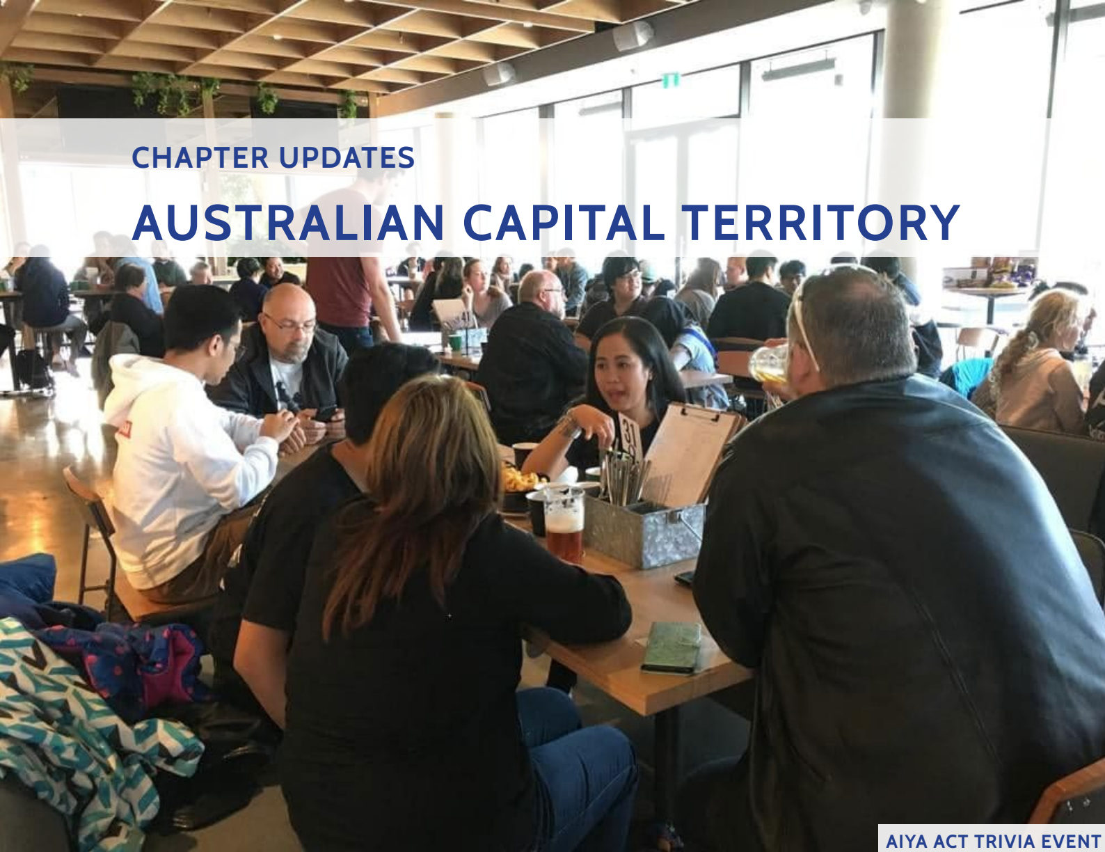
AIYA ACT TRIVIA EVENT

AIYA ACT has had another active year, hosting among other things, an election panel, a trivia night, a gamelan performance and a martabak night. Each of these events had over 60 people in attendance. We also had some more intimate events, including a welcome BBQ, a bushwalk, a cooking class, several language exchanges and a dance workshop.