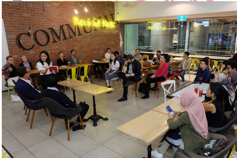
MALAM KARIER: SMART NETWORKING, INTERVIEW READY

We would like to thank our members for their involvement and support in 2019. The committee is already lining up a number of exciting events for 2020 so stay tuned and salam semangat!