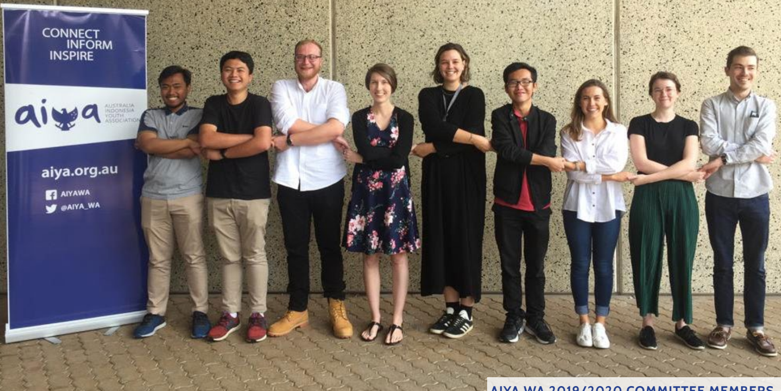
AIYA WA 2019/2020 COMMITTEE MEMBERS

Since the publication of the last AIYA Annual, the AIYA Western Australia committee has succeeded in holding and attending a number of events.