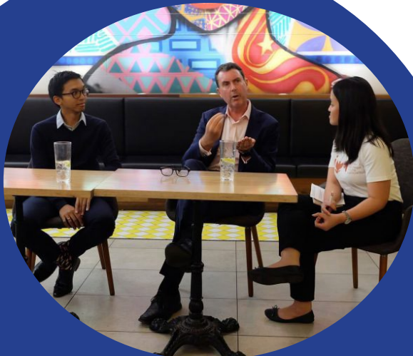
QUEENSLAND MALAM KARIER

The AIYA Blog continues to bring a youth voice and perspective to all matters of importance to Australia and Indonesia. In 2019, we received a number of great submissions from members and readers alike, which has been particularly important for driving more engagement with AIYA's website.