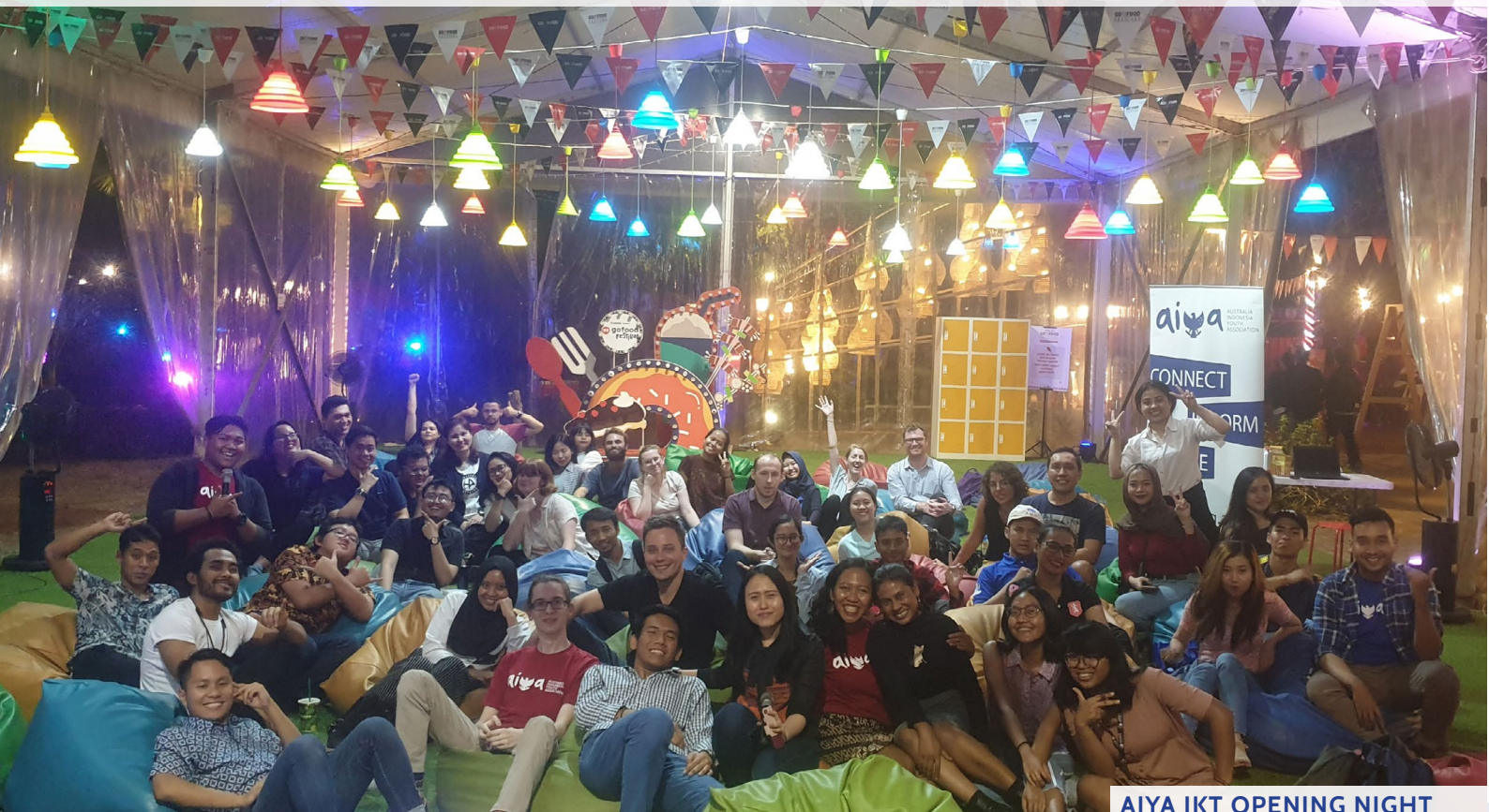
AIYA JKT OPENING NIGHT

2019 has been remarkable for AIYA Jakarta, with a lot of important events happening over the course of the year!