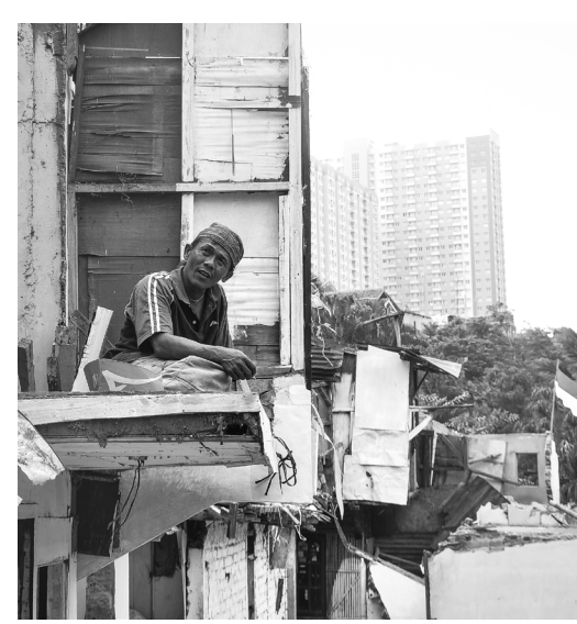
A MAN VOLUNTARILY DISMANTLING HIS HOUSE BIT BY BIT IN ORDER TO SELL THE SALVAGED MATERIALS

In 2013, Bandung elected a new mayor in Ridwan Kamil, who wanted to create a better and more prosperous Bandung for its inhabitants. One part of his plan was to increase the happiness index of the city by creating numerous parks and open spaces so people could interact more in public. Unfortunately, Kampung Babakan Siliwangi fell into a “Green Open Area” in these development plans, meaning it was slated to become parkland.