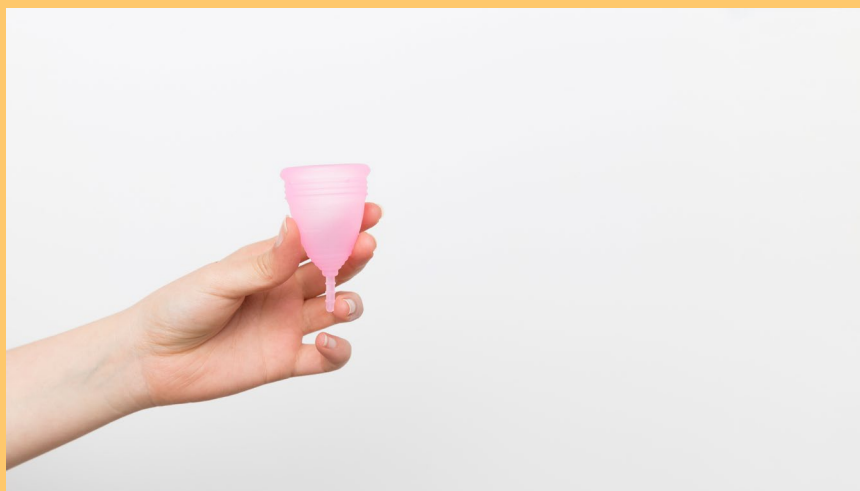
FREEPIK.COM. THIS PHOTO HAS BEEN DESIGNED USING RESOURCES FROM FREEPIK.COM

Akibatnya, perjalanan menggunakan menstrual cup panjang sekali bagi saya, tetapi saya senang dengan dampak sampah yang dapat dikurangi lewat tindakan yang kecil. Saya harap wanita yang membaca artikel ini dapat mempertimbangkan untuk menggunakan menstrual cup - apakah dimulai dari bulan depan atau 10 tahun lagi, perjalanan ini berbeda untuk setiap orang. Tolong bicara dengan dokter Anda sehingga bisa berdiskusi kapan dan bagaimana cara terbaik untuk Anda pribadi. Marilah kita berpikir bagaimana perubahan besar dapat dimulai dari perubahan kecil lewat kebiasaan dan gaya hidup kita sehari-hari.