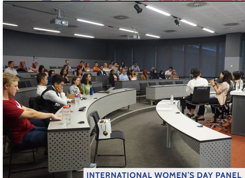
INTERNATIONAL WOMEN'S DAY PANEL

Language Exchange has been greatly improved this year. Attracting students and professionals alike, our weekly catch ups now have more structure through the use of guiding questions and vocabulary lists. We have also taken LX outside of the classroom! For example, participants have visited VIVID Sydney and also dined together at several Indonesian restaurants while practising their Indonesian/English!