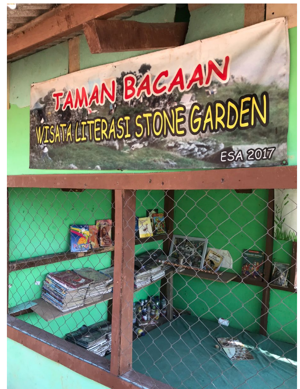
"BOOK GARDEN" AT STONE GARDEN, WEST BANDUNG

In order to tackle the problem of low interest in reading, one of the measures taken by the Jokowi government has been the launch of "Gerakan Literasi Nasional" (GLN). Since 2016, this nation-wide plan aims to stimulate people to read more books and to read more often. School children now have to read at least 15 minutes a day in class, while specially designated literacy ambassadors try to motivate children to read more often. The introduction of reading competitions and special reading gardens at schools include some measures that should help the GLN to produce results. Also, the rising number of NGOs focusing on (early childhood) literacy and the creation of public libraries are movements which give cause for hope. One visible local initiative is the Bemo Baca: small buses (bemo) that are converted into moving libraries, making books more accessible and creating comfortable places to read. This is a welcome solution for those who live in fringe areas or cannot afford a membership to the school library.