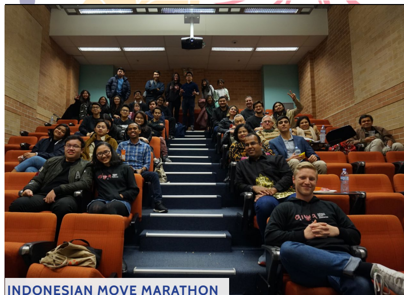
INDONESIAN MOVIE MARATHON