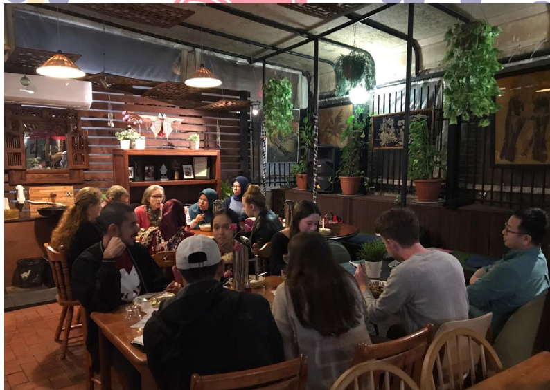
BUKA PUASA X SLANG LANGUAGE EXCHANGE