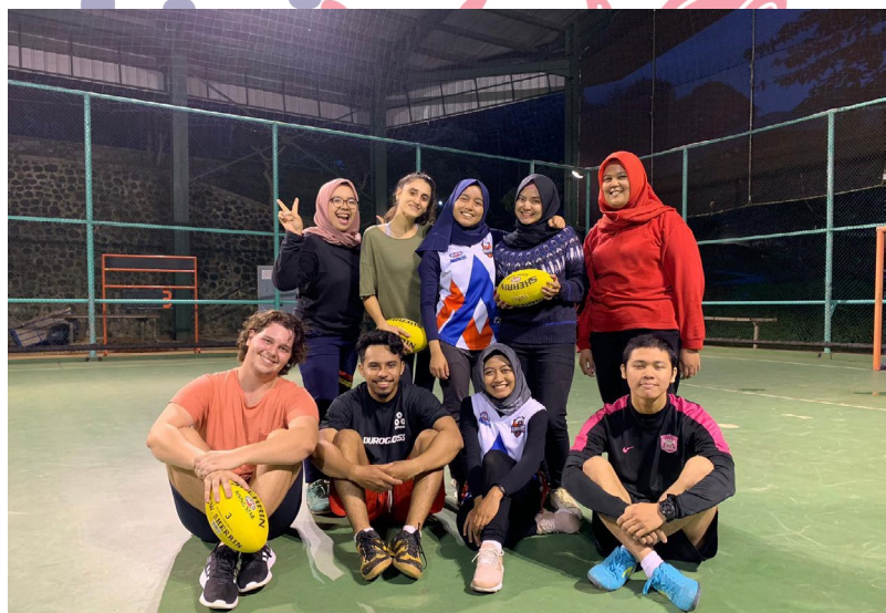
LEARNING HOW TO PLAY AUSSIE RULES

19 October - For AIYA Share and Care, we visited a local orphanage, Panti Asuhan Tunas Bangsa to donate the books collected through our book donation drive, as well as ran traditional party games and shared yummy Australian snacks with the children.