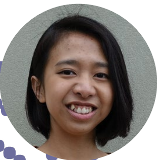
WELLA ANDANY BLOG EDITOR