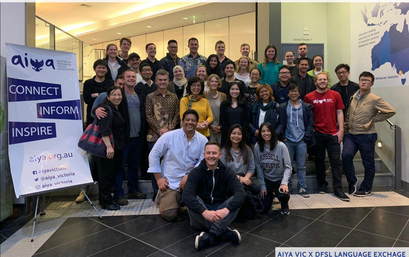
AIYA VIC X DFSL LANGUAGE EXCHANGE

AIYA Victoria was bigger and more active than ever in 2019. We organised 72 events and collaborated with many external partners. We also experienced a significant increase in memberships since last year (from 63 to 116 members)!