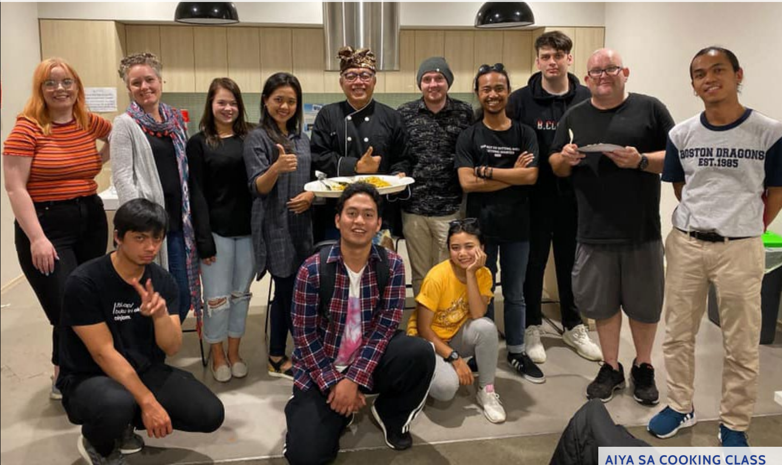
AIYA SA COOKING CLASS