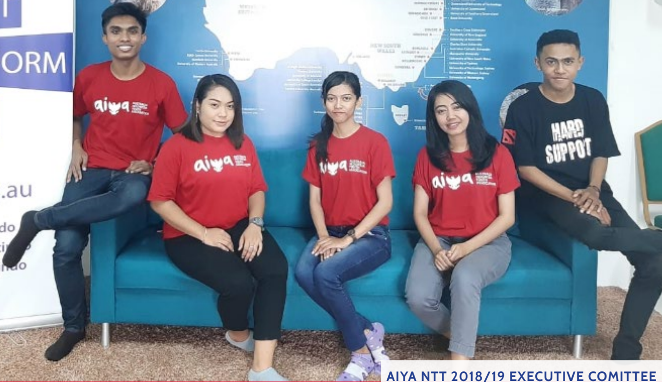
AIYA NTT 2018/19 EXECUTIVE COMMITTEE

Facebook: aiya.eastindo Twitter: @aiya_eastindo Instagram: @aiya.eastindo