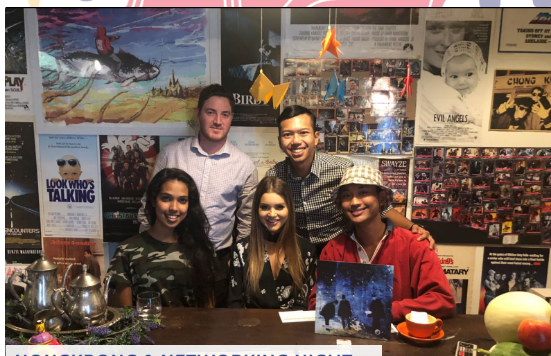
NONGKRONG & NETWORKING NIGHT