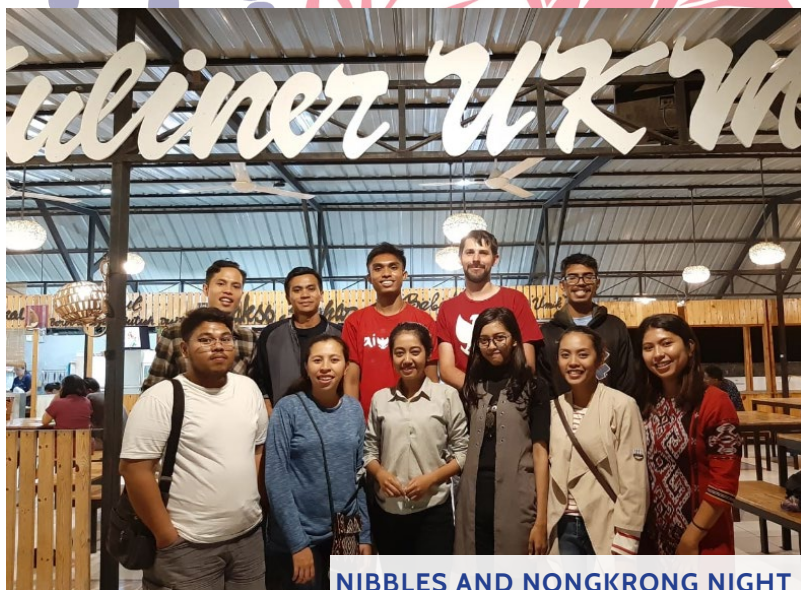
NIBBLES AND NONGKRONG NIGHT

Overall, 2019 has been a great year for AIYA East Indo - NTT! Our sincere thanks and appreciation goes to everyone who has supported us throughout 2019. We want to also pass our thanks on to the outgoing executive committee for their amazing contribution to the chapter and welcome the newly elected executive committee.