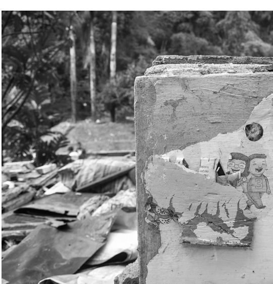
STICKERS ON THE WALL OF A GIRL'S BEDROOM