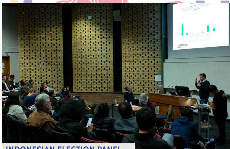
INDONESIAN ELECTION PANEL