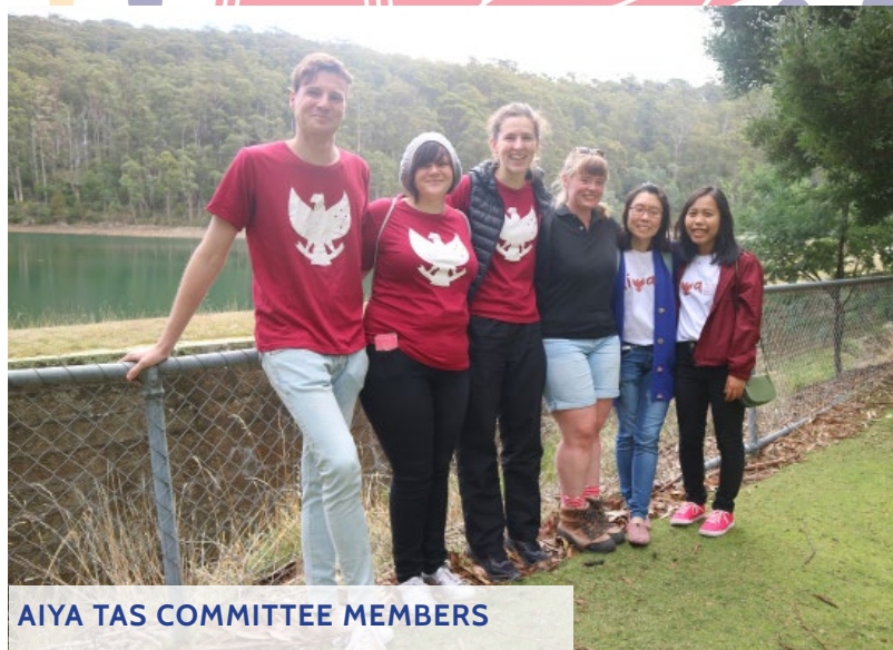
AIYA TAS COMMITTEE MEMBERS