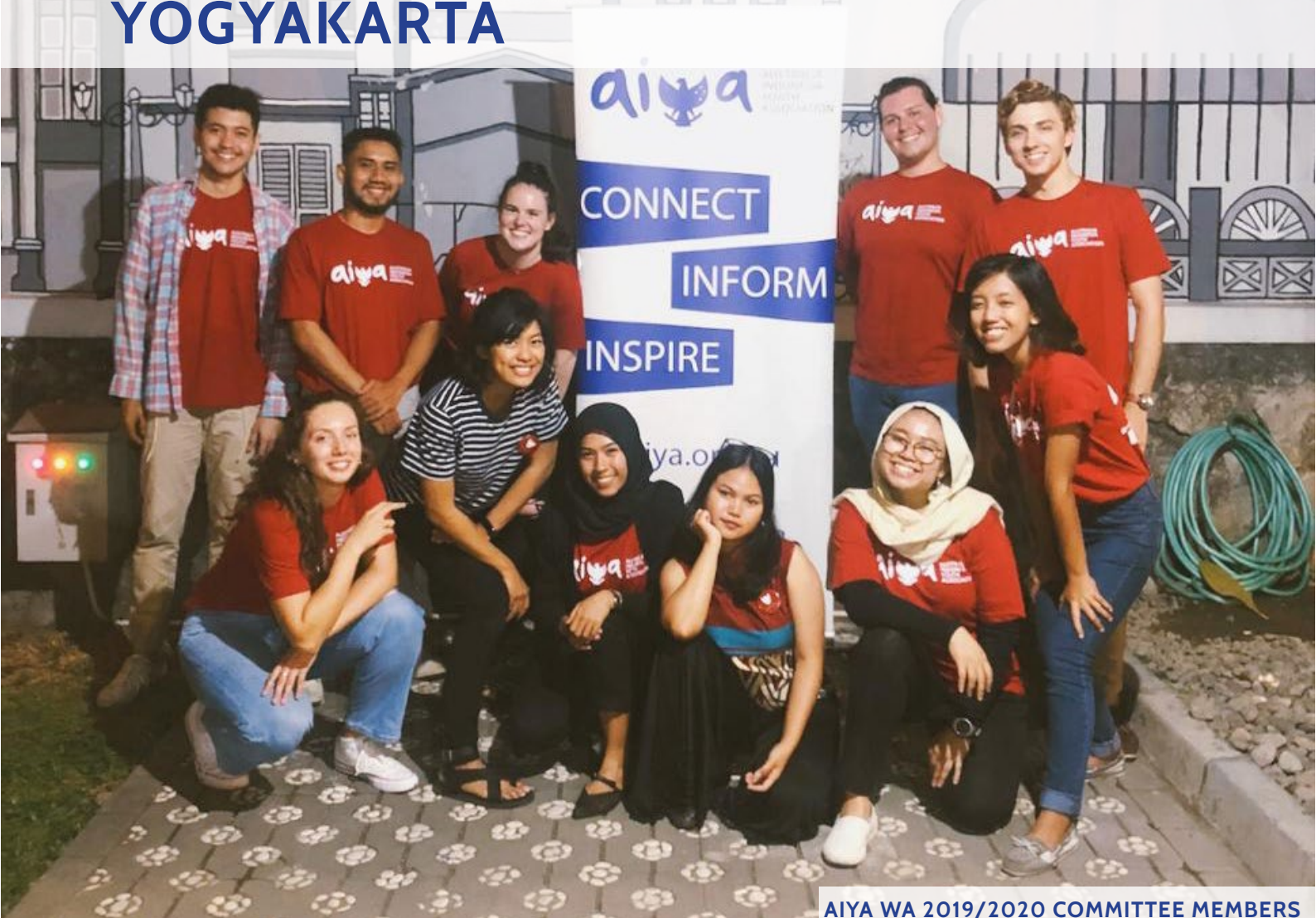
AIYA WA 2019/2020 COMMITTEE MEMBERS

A lot of exciting events were held in Yogyakarta throughout 2019. With activities ranging from education, sports, charity to zine making, we continually aspire to build a bridge of understanding between the youth of Australia and Indonesia.