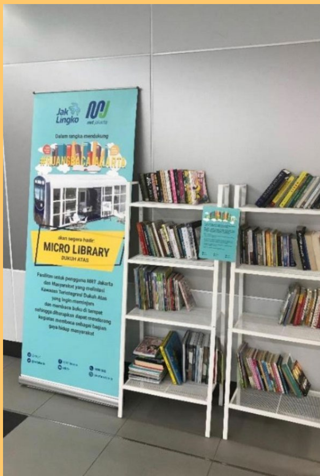
SMALL LIBRARY IN JAKARTA'S MRT STATION

“There’s this book I’ve wanted to read for a long time, but when I looked on the Internet at how and where to buy this book, it turned out it isn’t available in Indonesia and that the prices for shipping and delivery from overseas are extremely expensive. Being unable to get this book has left me disappointed. For me, reading is not only just about having a book in my hands; it is also a way to develop my ability to absorb new information and then use it for many things in my daily life.”