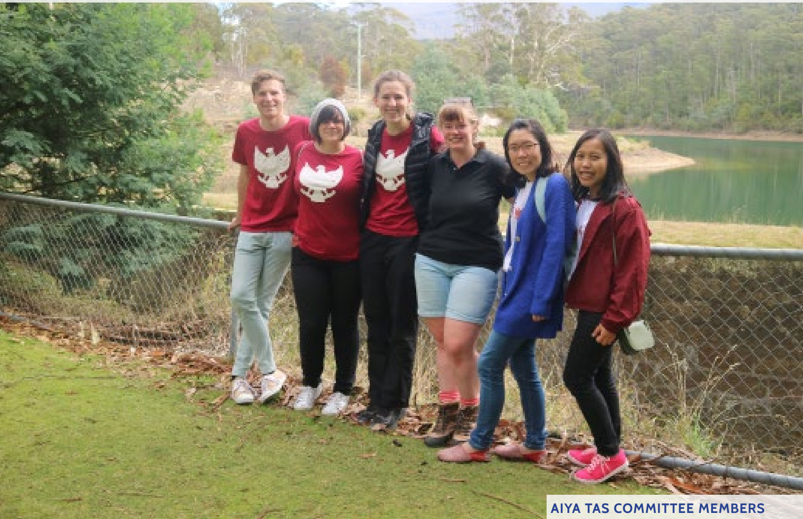
AIYA TAS COMMITTEE MEMBERS

In 2019, AIYA Tasmania continued to grow by adding new committee members and hosting new events!